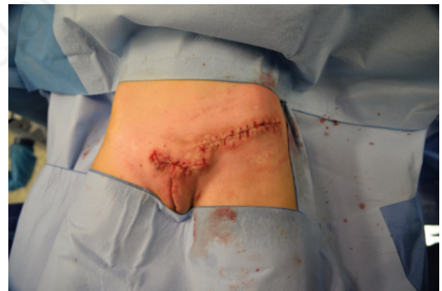
Figure 4. Left groin and pubic wounds after complete excision was performed.

Wound healing complications, often caused by the onset of bacterial or fungal infections, for which these patients are bur-